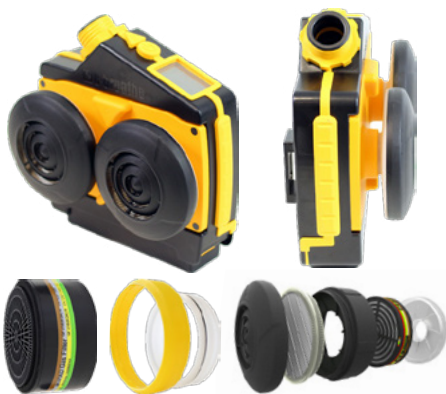
Fully flexible modular system with comprehensive filter and accessories range

Over three decades P.M. Atemschutz have become leading experts in respiratory protection and gas warning devices. Based in Mönchengladbach, product design, development and production are maintained in Germany, so users benefit from the confidence of German know-how and engineering. The partnership between Lakeland and P.M. Atemschutz for the new PAPR range of protective clothing combines the expertise of two world-leading PPE manufacturers.