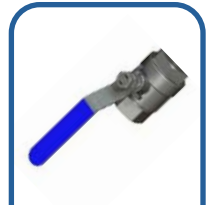
MANUAL DRAIN VALVE