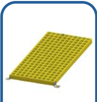
GRITTED GRP PLATFORM