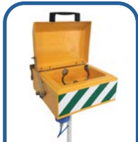
EYEBATH (fitted internal or external)