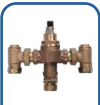
THERMOSTATIC MIXING VALVE