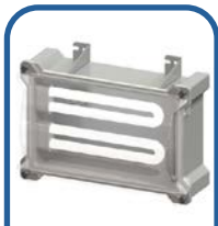
LOW ENERGY LIGHTING