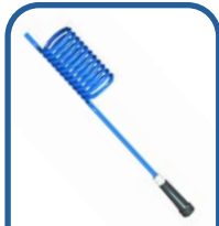
FLEXIBLE FACE/ BODY WASH