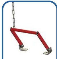
EYEBATH FOOT TREADLE