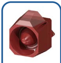
FLASHING ALARM & SIREN