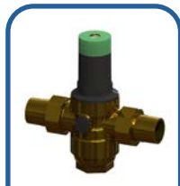
PRESSURE REGULATING VALVE