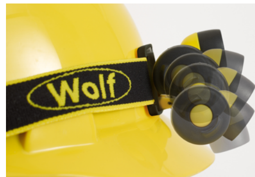
A tilt mechanism allows the beam to be directed where needed