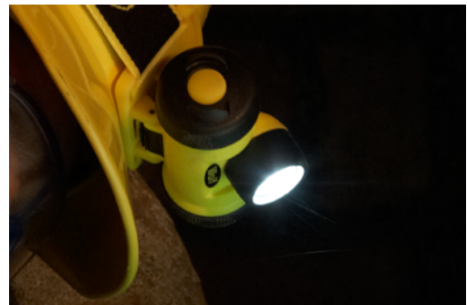
The HT-400Z0 allows hands free illumination