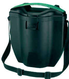
Advantage 3000 container