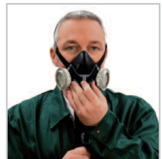
Pull down front straps and lock lever