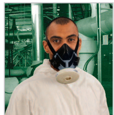
Advantage 410 with P3 PlexTec filter

For detailed information on standard thread filters please see leaflet 05-100.2.