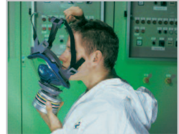
Put your chin into the chin cup