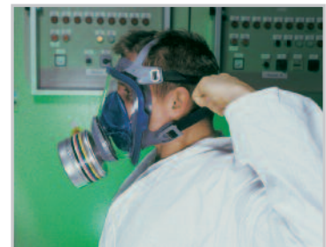
Tighten the two lower straps

The full face mask series Advantage 3000 provides both protection and unparalleled comfort. The soft sealing line made of hypo allergenic silicone provides a pressure-free fit. The large, optically corrected lens ensures a clear, undistorted view, while the grey-blue colour gives the mask an aesthetic appearance.