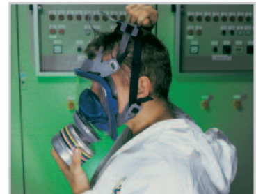
Pull the harness over your head