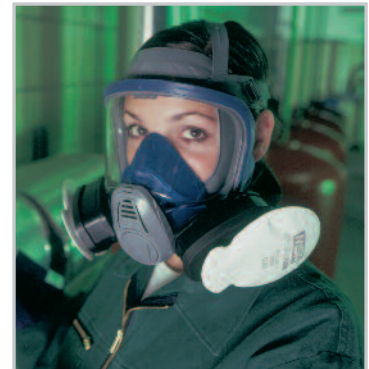
Advantage 3200 with TabTec and FLEXIfilter

The three filter lines are for use with Advantage 3200, Advantage 200 LS and Advantage 420.