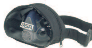
Pouch for Advantage 200 LS