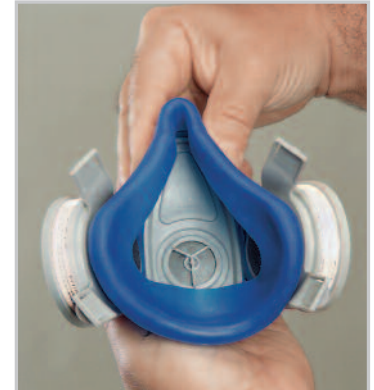
Facepiece-to face Anthrocurve

The Advantage 200 LS is a comfortable, efficient and economic half mask. It is ideal for applications where workers are exposed to various hazards from job to job, such as high concentrations of fumes, mists and gases.