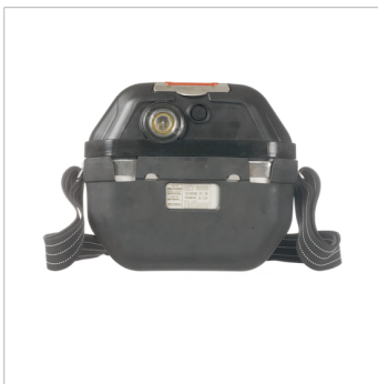
Dräger Oxy® 3000/6000

Robust and always under control: the oxygen self-rescuers Dräger Oxy® 3000 and 6000 are designed to handle the harshest conditions. Their new product concept reliably protects the internal functional unit against damage. The Safety Eye provides an additional level of security: the status window allows the user to assess whether the device is operational within seconds.