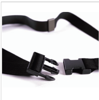
Dräger Saver Waistbelt