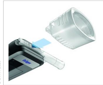
Fast switchover from funnel-based to mouthpiece-based testing