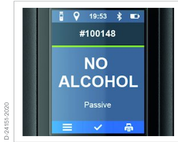
The 2.4" colour display provides information, notices and warnings