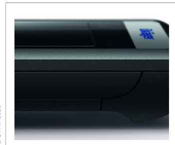
Rubberised handling area for a secure grip