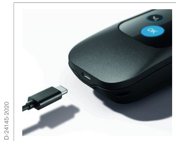
USB-C interface for easy downloading (while stationary or on the move)