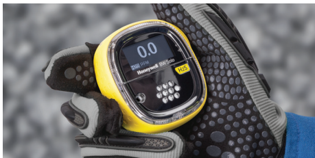
Easy to handle