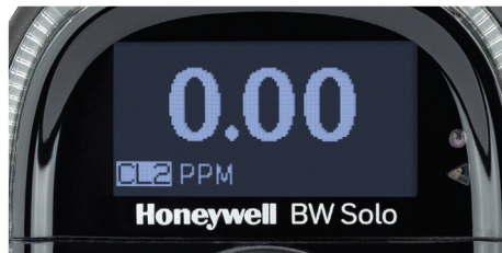
Easy to read