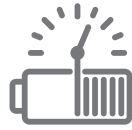
ACCURATE BATTERY STATUS INFO