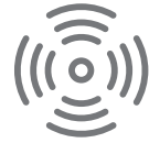
SEND DATA TO UP TO 3 SERVERS