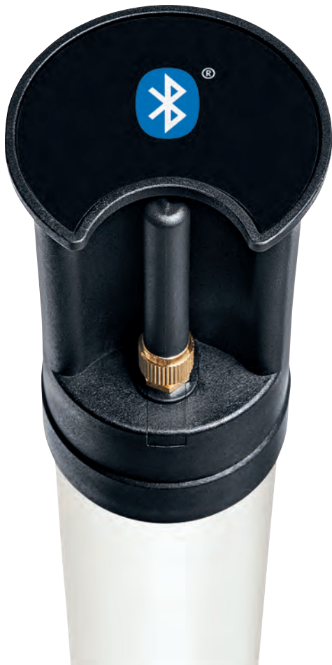
INTEGRATED BLUETOOTH LOW ENERGY (BLE) COMMUNICATION

The ecoLog 1000 is durable and corrosion resistant to saline water, due to the complete sensor element being made of 904L stainless steel. It also includes enhanced alarm management including alarm messages and action management, for automatic adjustment of measurement or transmission intervals.