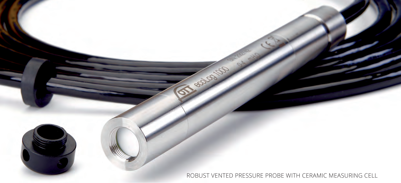
ROBUST VENTED PRESSURE PROBE WITH CERAMIC MEASURING CELL