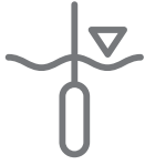
CERAMIC PRESSURE CELL (DURABLE AND ROBUST)