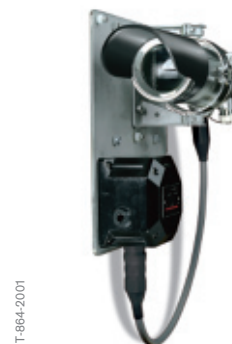
Dräger Polytron Pulsar Open Path Gas Detector for gaseous hydrocarbons.

The detector is designed so that no fault can go undetected. In normal operation the output signal is 4 to 20 mA, depending on the gas concentration measured. Whereas a signal of < 1 mA indicates a fault and a signal of 2 mA indicates a beam blockage. In addition a continuous self-test of the Dräger Polytron Pulsar will issue a pre-warning signal of 3.5 mA where the detector is still operational but requires some attention – for example when there is a build up of deposits on the optics, or misalignment of the transmitter or receiver. This way maintenance can be scheduled without downtime. The Dräger Polytron Pulsar carries a Safety Integrity Level rating of 2 (SIL 2).