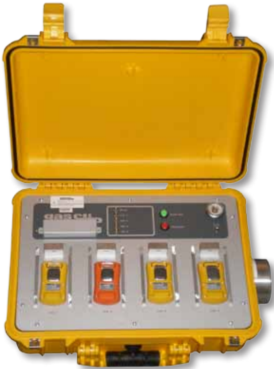
"Clip Dock" Docking Station