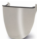
WV100003 FULL FACE VISOR