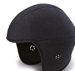
UPA00001 WINTER PADDING