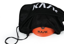
UAC00002 HELMET BAG