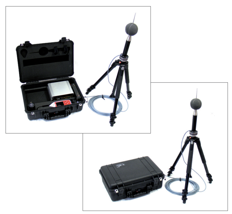
CK:670 Outdoor Kit shown with optional CT:7 Tripod

NoiseTools will display verification symbols if the information matches, a unique feature which will be useful in any legal proceedings.