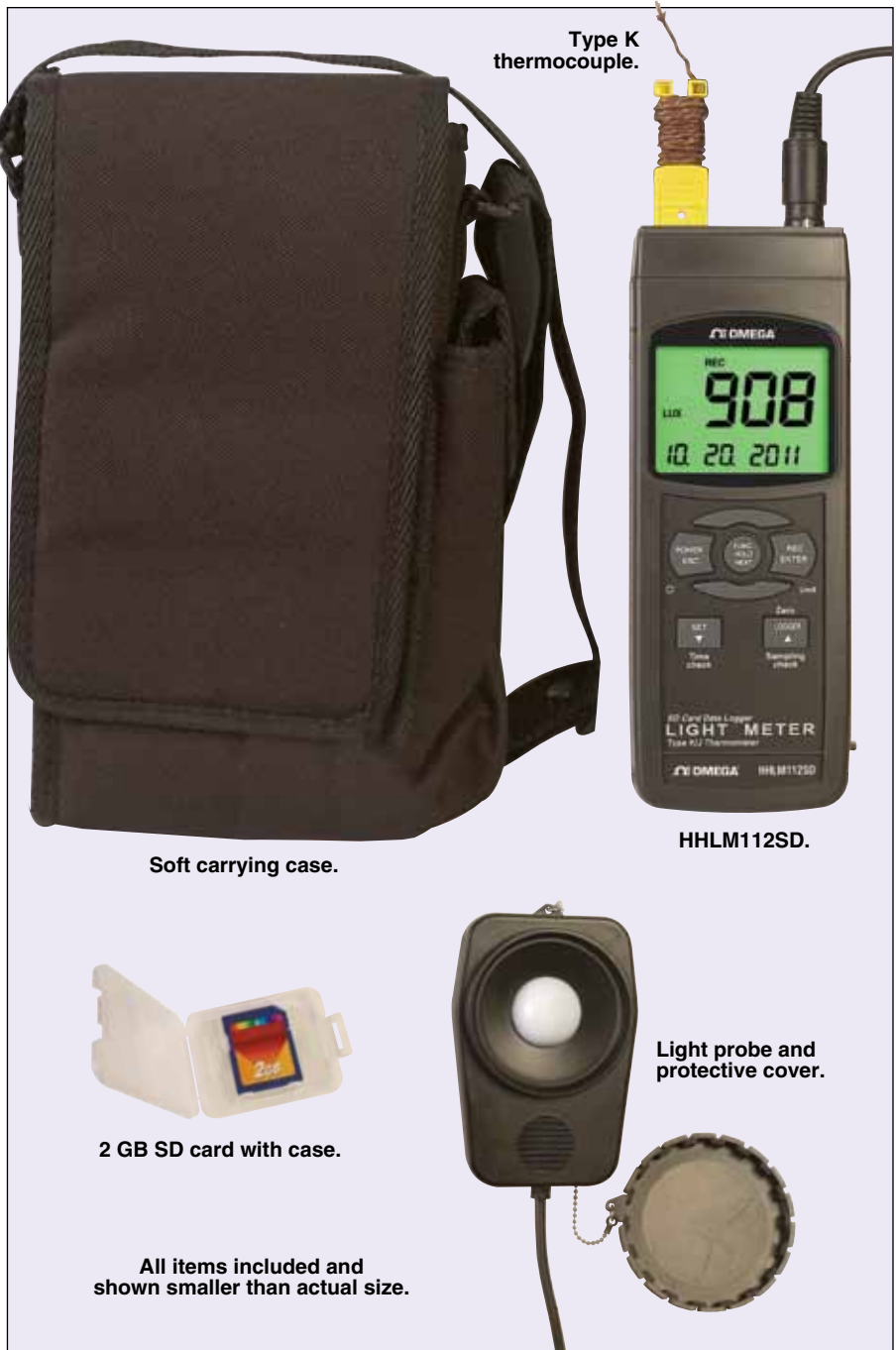
Soft carrying case.

OMEGACARE SM extended warranty program is available for models shown on this page. Ask your sales representative for full details when placing an order. OMEGACARE SM covers parts, labor and equivalent loaners.