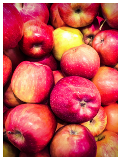
On the Farm

All NIRQuest spectrometer models have a replaceable slit design, increasing measurement flexibility. The freedom to adjust the width of the slit helps eliminate configuration trade-offs by giving users the ability to adapt spectrometer performance, without the need for recalibration. Also, users can add to NIRQuest an optional internal shutter, to manage light throughput and dark measurements. The shutter is useful for applications where placing an external shutter is difficult, such as emissive setups and probe-based measurements. Also, internal shutters are more convenient for applications where light intensities change, requiring users to dynamically adjust integration times and renormalize the spectrometer. Operation via software makes shutter control as simple as a few keystrokes.