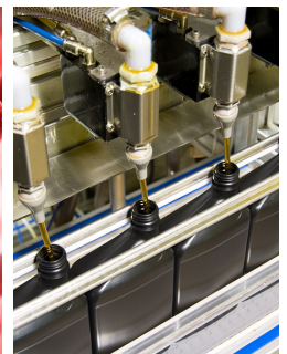
On the Line

Combine NIRQuest with our line of light sources, accessories and software for a wide range of application challenges.